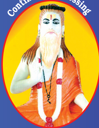
Siddh Shiromani Baba Mast Nath Ji