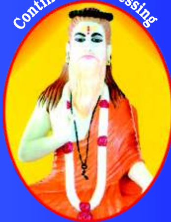
Siddh Shiromani Baba Mast Nath Ji